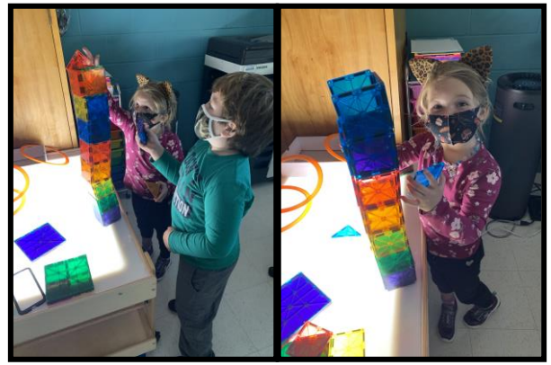
Fire Safety Week

Our Kindergarten students are really loving spending time at the light table. Here they are learning about geometric forms and structures and stability.